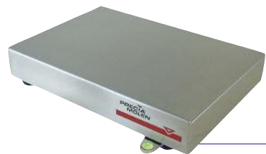
▶ Industrial scales