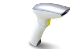
▶ Bar code readers