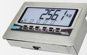
i40 PM Front panel