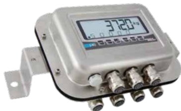
i40 JB Junction box