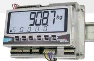
i40 DR Din rail