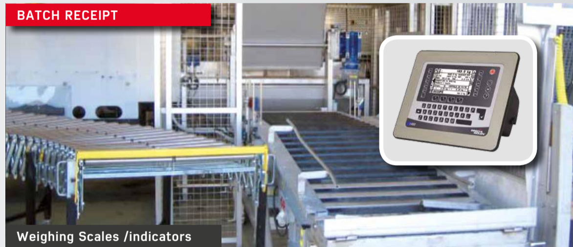
Weighing Scales / indicators