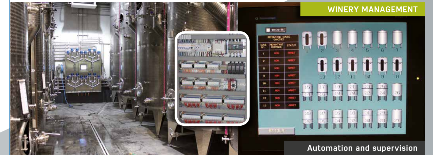
Automation and supervision