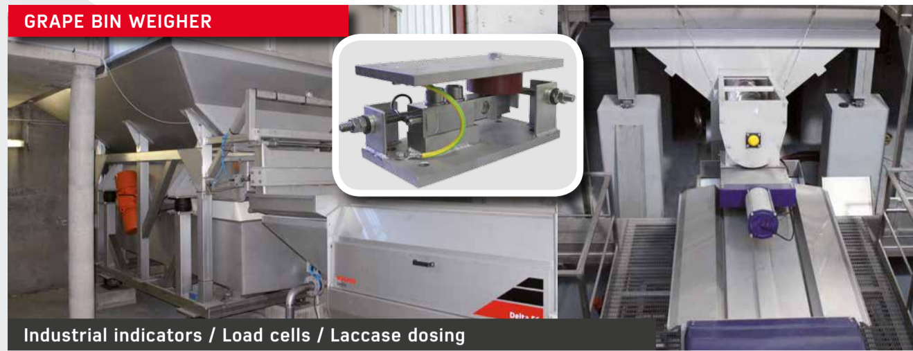
Industrial indicators / Load cells / Laccase dosing