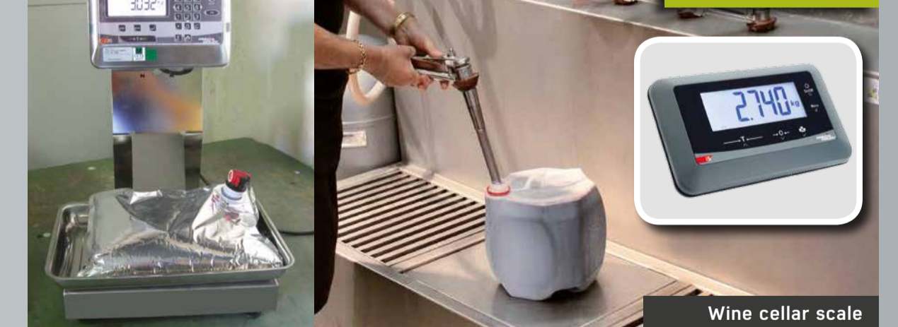
Wine cellar scale