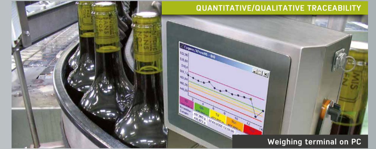
Weighing terminal on PC