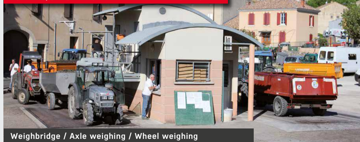
Weighbridge / Axle weighing / Wheel weighing