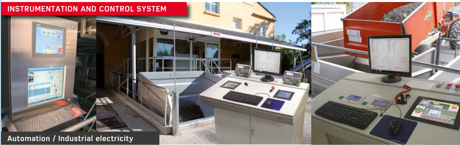
Automation / Industrial electricity