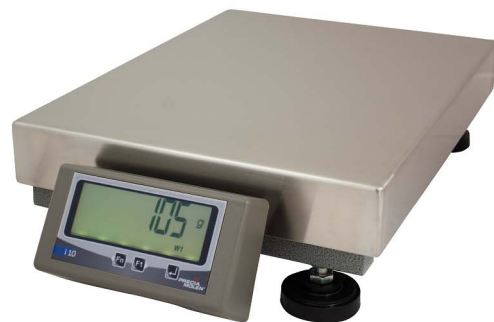
Ci10 P - 400 x 300 - 30 kg (parcel)