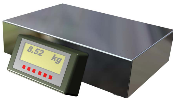
Ci10 P - 325 x 225 - 10 kg (mail)