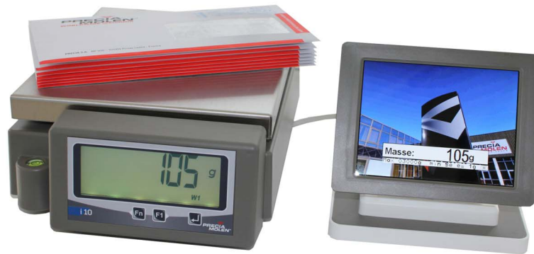
Ci50 P - 240x200 - 10 kg or 20 kg (mail)