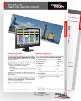
DATABULK ABS SUPERVISION