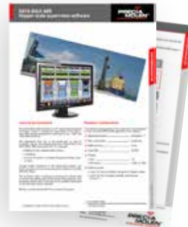
DATABULK ABS SUPERVISION