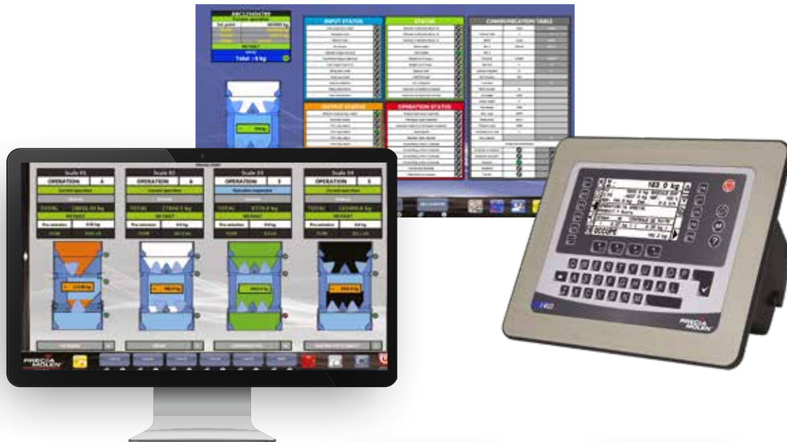
I 410 ABS CONTROLLER