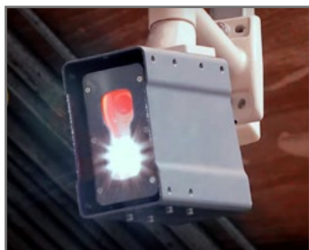
NUMBER PLATE RECOGNITION CAMERA